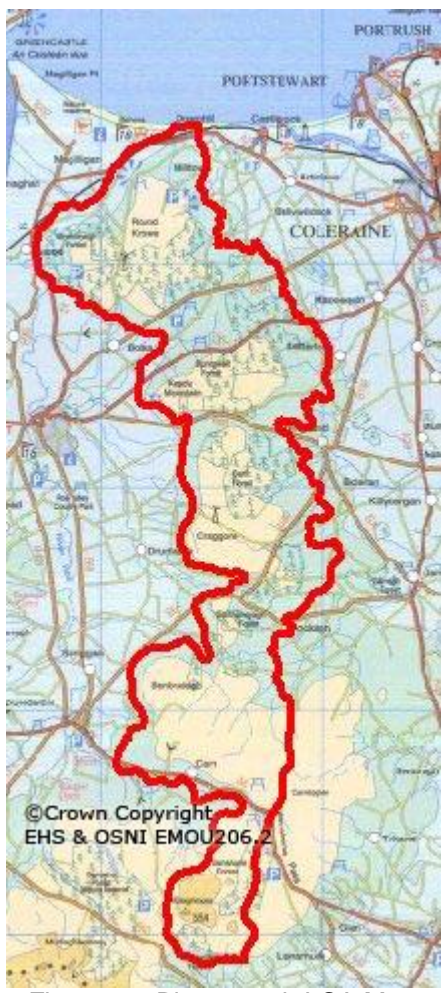
Figure 2.1 Binevenagh LCA Map

A map of the area is shown below. For the full Binevenagh landscape character assessment report see Appendix A05 volume 2.