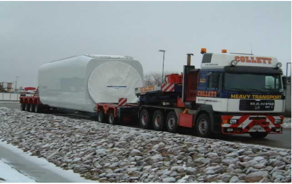
Figure 7.7 Nacelle transport vehicle