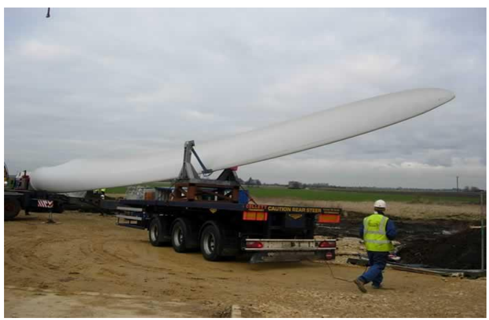
Figure 7.7.2 Blade transport vehicle